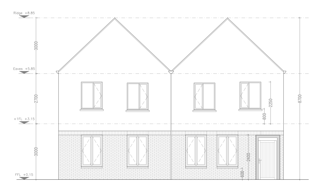
House Type L1 Semi-Detached Front Elevation