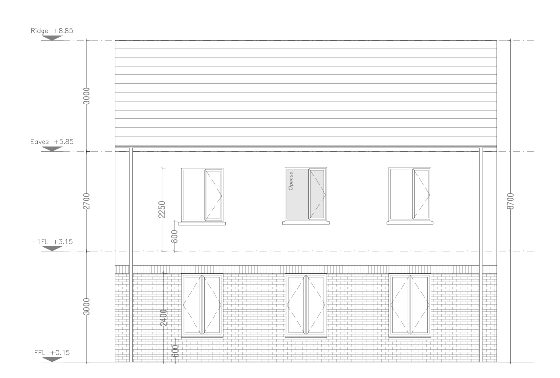
House Type N3 Semi- Detached Side Elevation